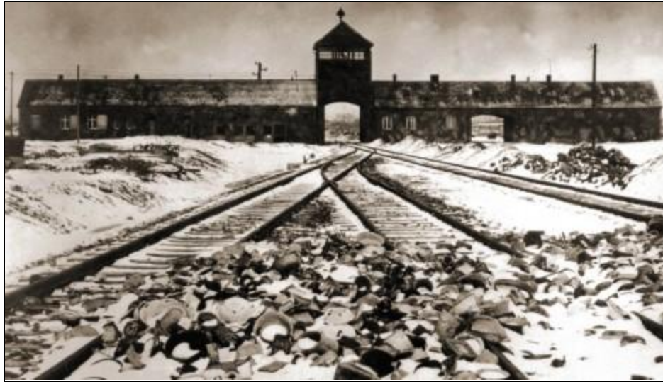
Death camp: Auschwitz, where tens of thousands of slave labourers died working in a factory run by German firm I. G. Farben

There was a sharp intake of breath as he began to speak. German industry must realise that the war cannot be won, he declared. 'It must take steps in preparation for a post-war commercial campaign.' Such defeatist talk was treasonous - enough to earn a visit to the Gestapo's cellars, followed by a one-way trip to a concentration camp.